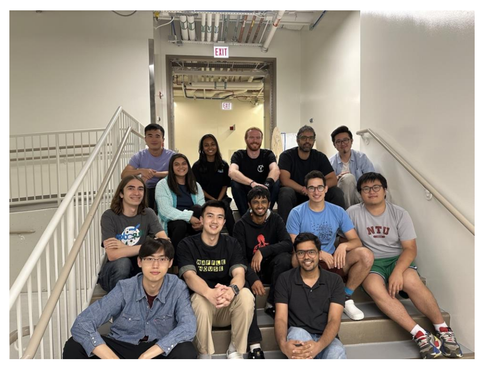
Bernien lab photo (Hannes is not here)