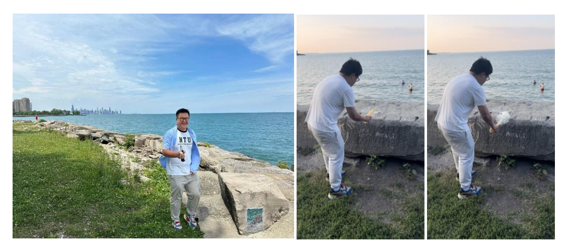
Knock knock who's there @ the promontory point