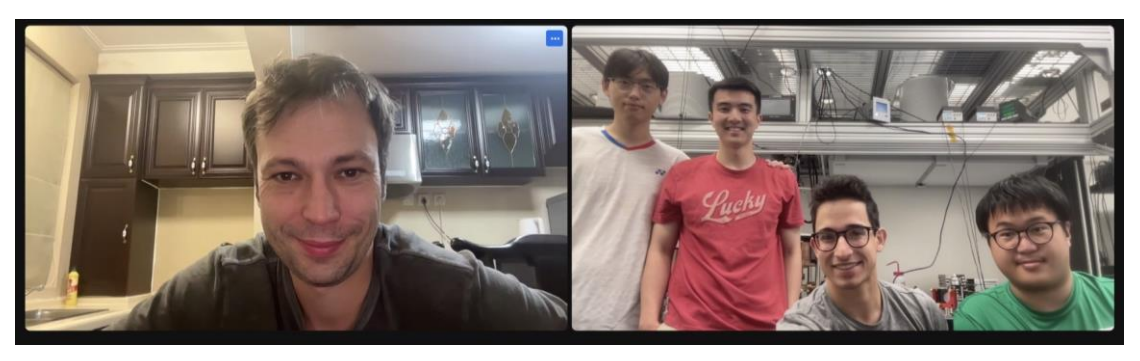
Purple lab family photo