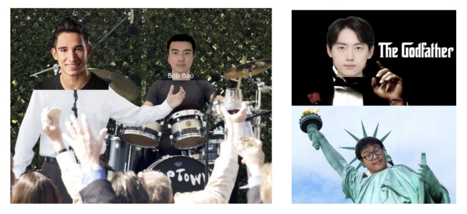
Purple lab's last group meeting: Con te partirò