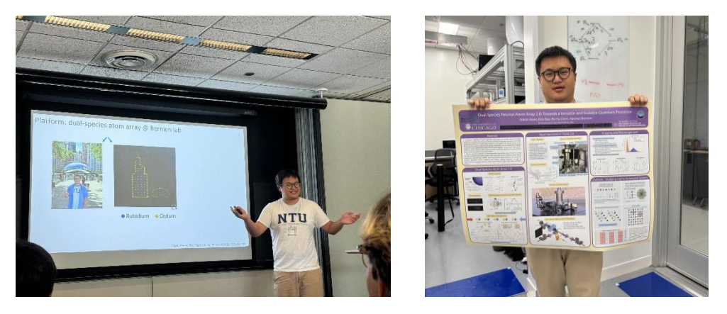
Left: Final Presentation; Right: poster presented on SIF Fermi School

I am happy to learn many things from this project and proud of it. I wholeheartedly look forward to trigger the community's interest in the rearrangement algorithm after publishing the works. : )