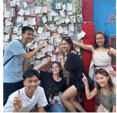
The UChicago-Taiwan Student Exchange Program

I'll admit that, at first, Taipei disappointed me. In part, this was a case of expectations. Last winter I traveled across China, which impressed me with its sheer power, wealth, and enormous velocity towards modernity. In some shallow way, it fascinated me, and I wanted in on it. But Taipei, in appearance, was not quite that gleaming Eastern city, visibly ripe with economy, that I had admired, envied, and sought to know. The boxy and water-stained buildings appeared to me ugly and ramshackle; the reliance on cash was rudimentary and inconvenient; the offices and facilities where I worked were cramped and messy. It didn't help that I spent the morning I arrived in Taipei wandering the backstreets of Datong—lost, sweaty, confused.