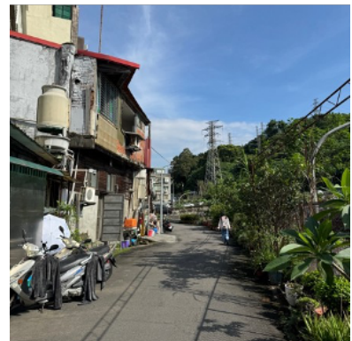
Initial impressions of Taipei